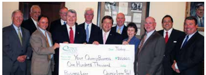
The Quincy Loan Pool and City of Quincy Community Development Block Grant financing program provides start-up financing and working capital to Quincy businesses.