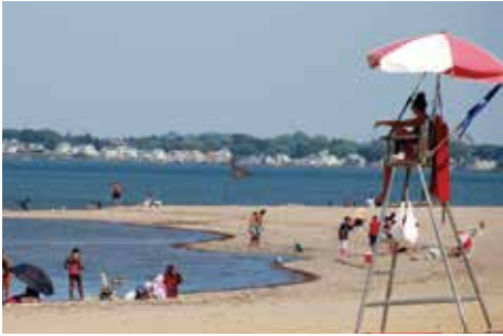
Quincy Shore Reservation