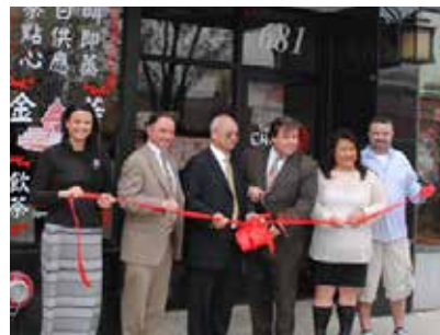
The China Restaurant and Pub