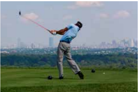
Granite Links Golf Club