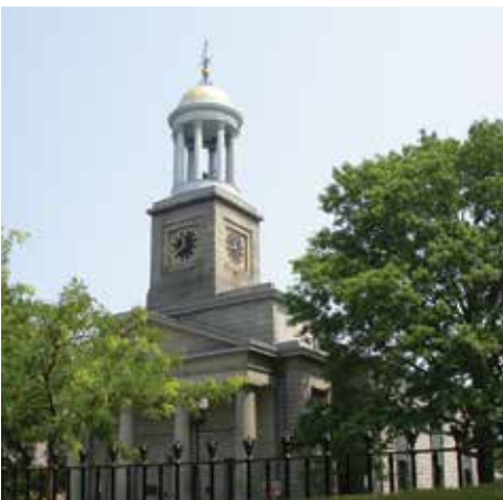
Church of the Presidents