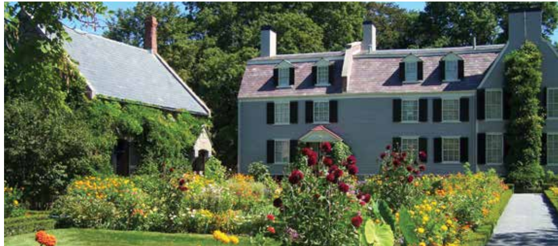
Garden view of Peace field, the summer White House of 2nd U.S. President John Adams and the Presidential Library.

Building upon an authentic and vibrant history the City of Quincy is well positioned to strengthen its presence as a destination community to live, work, visit and invest in.