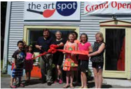
The Art Spot