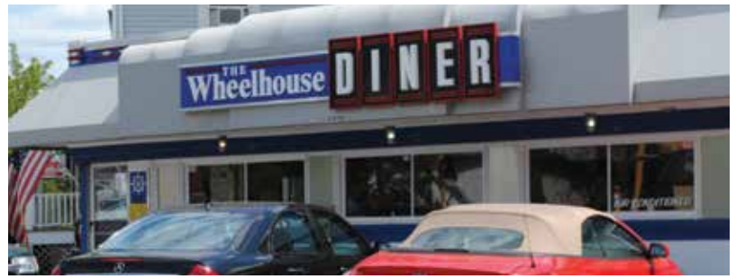
The Wheelhouse Diner has been serving the Quincy community for over 65 years.

New businesses strengthen the city's entrepreneurial spirit as long standing family owned enterprises provide the foundation of a vibrant economy.