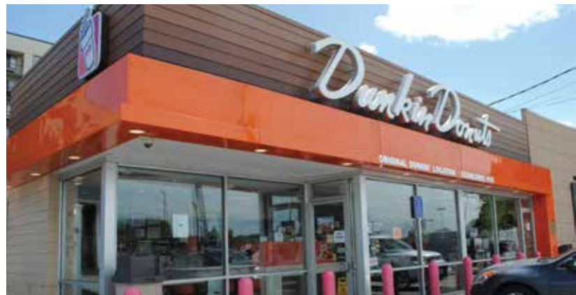
Site of the first Dunkin Donuts established in 1950.

New businesses strengthen the city's entrepreneurial spirit as long standing family owned enterprises provide the foundation of a vibrant economy.