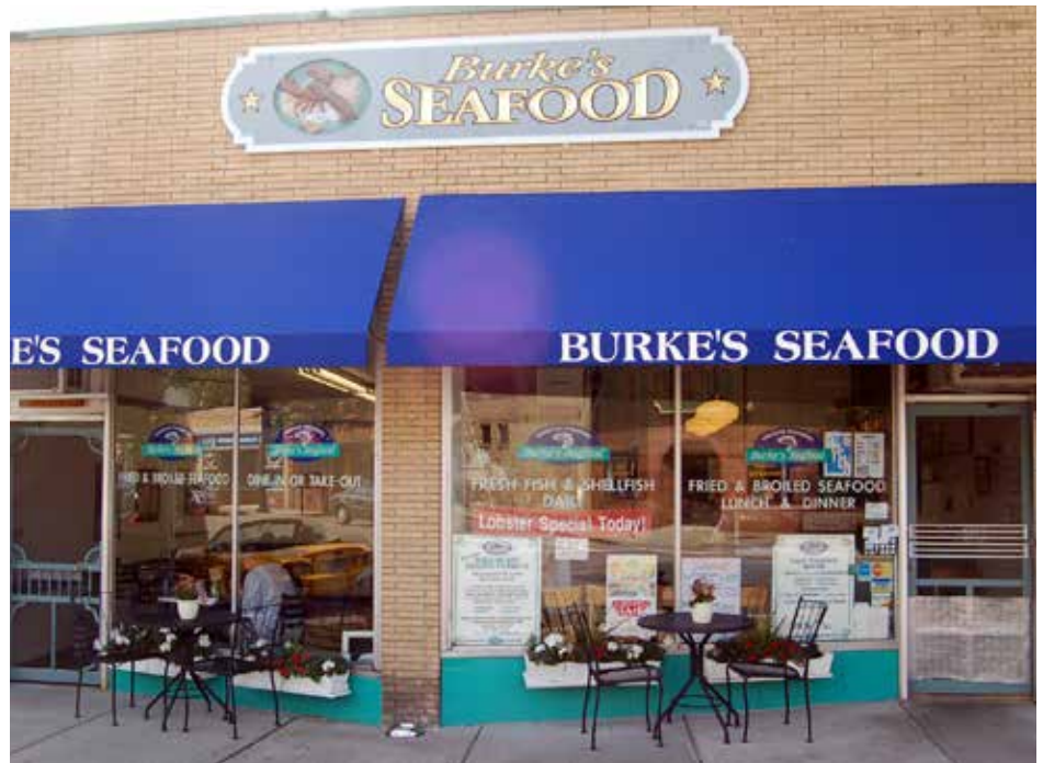
Burkes Seafood has been providing fresh seafood to Quincy residents for 36 years, under the leadership of two generations.