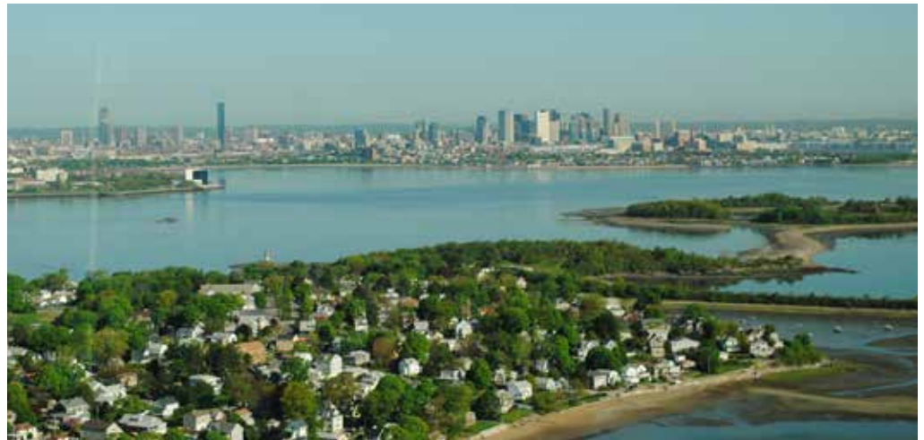
Squantum neighborhood overlooking Quincy Bay/Boston Harbor.

Known as the dining capital of the South Shore. Quincy offers everything from succulent seafood to mouthwatering ethnic cuisine available in the variety of eateries found in the city's many neighborhoods and business districts. Download the free "Discover Quincy" mobile app; a tool for residents and visitors to access information on local businesses, tourist attractions, recreation opportunities, dining establishments, and city services.