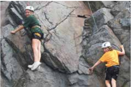
Rock Climbing at Quincy Quarries Reservation