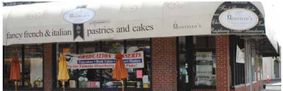
Operated by four generations, Montillio's Bakery has been a Quincy fixture since 1947.