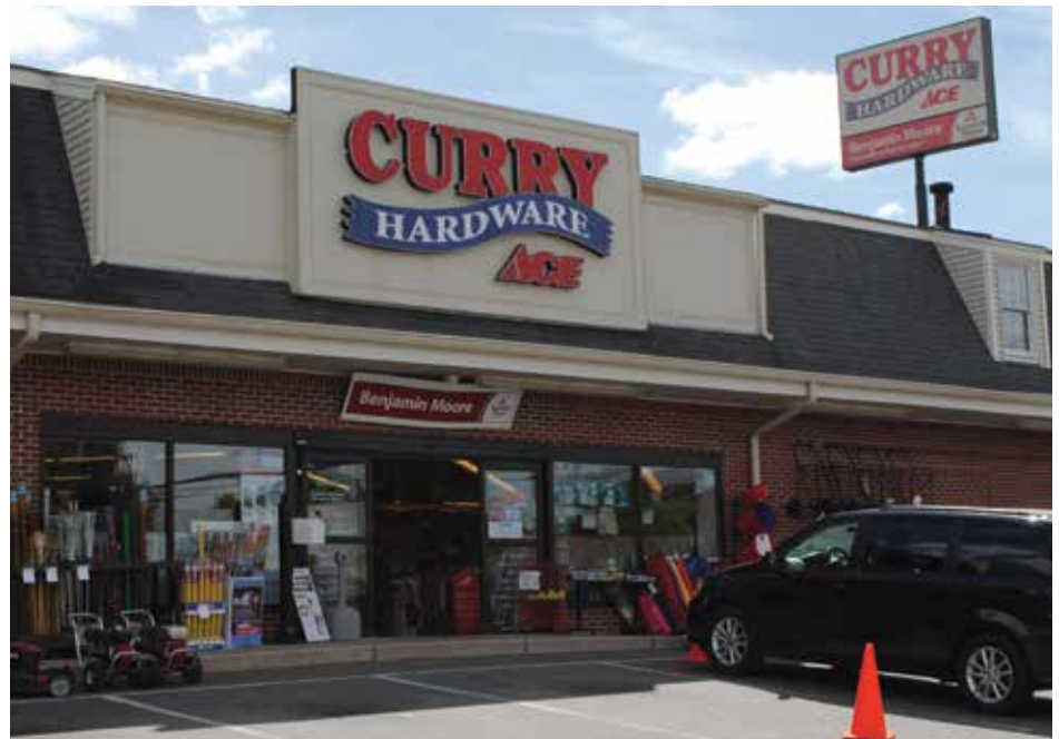
Four generations of the Curry family have operated the hardware store since 1945.