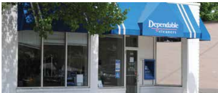
Three generations of the Faucett family have carried the torch since the first Dependable Cleaners opened in 1944.

In partnership with the City of Quincy, the Quincy Chambers’ economic development arm Quincy 2000 Collaborative provides a variety of resources and services to help strengthen these districts and the businesses within them. Through small business loans, individual counseling, permitting and licensing assistance and ribbon cutting celebrations the city and chamber are a ready partner. The Chamber’s active Business District Partnership program brings local businesses and city officials together to enhance the economic viability and vitality of these commercial centers throughout the community.