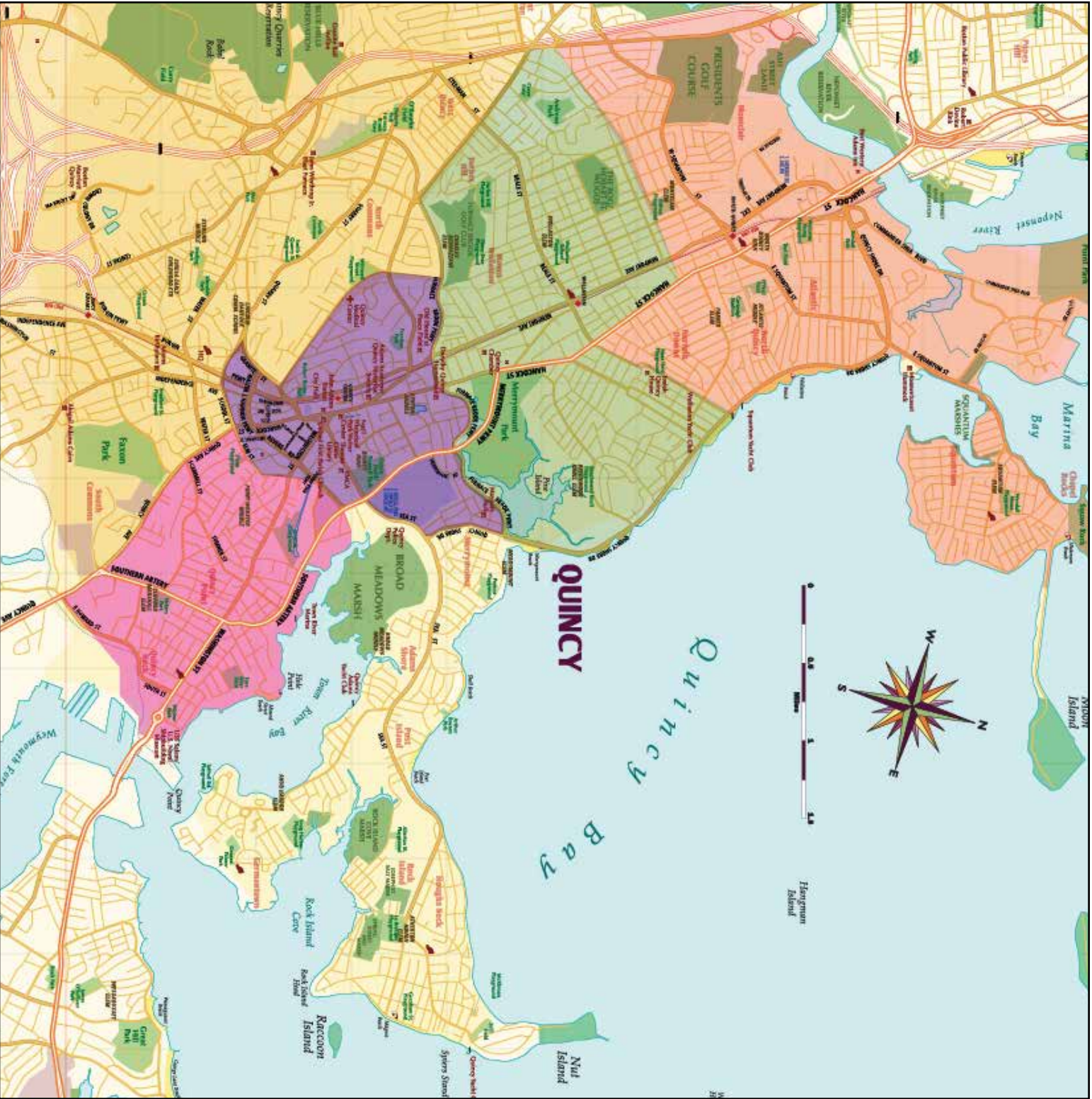
This map shows the projects detailed in this report, grouped by section of the city.