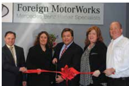
Foreign Motor Works