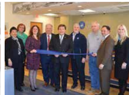
Mass Bay Credit Union